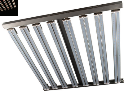
L x W x H = 47.5" x 48.5" x 2.5"